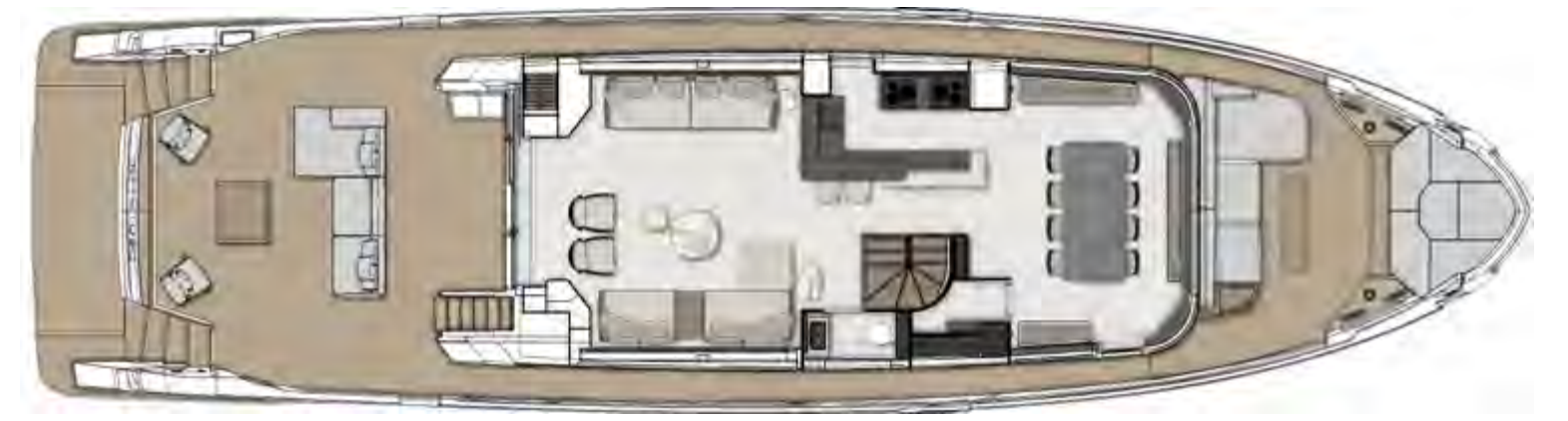
MAINDECK SHOW KITCHEN OPTIONAL