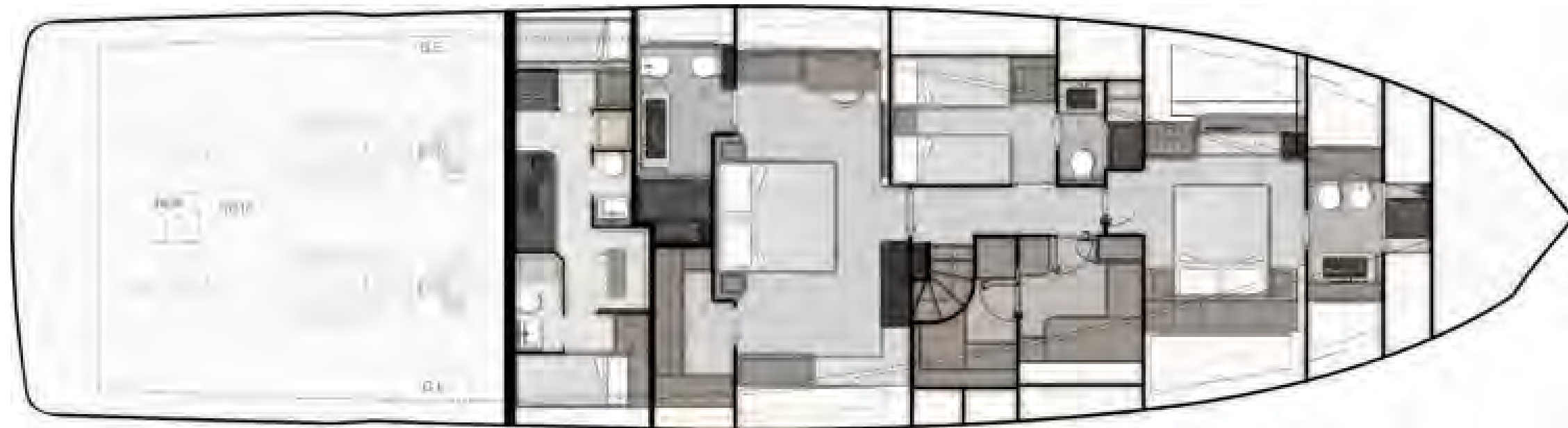
LOWERDECK OPTIONAL UTILITY ROOM