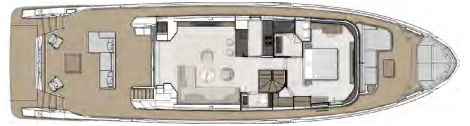
MAINDECK OWNER CABIN OPTIONAL