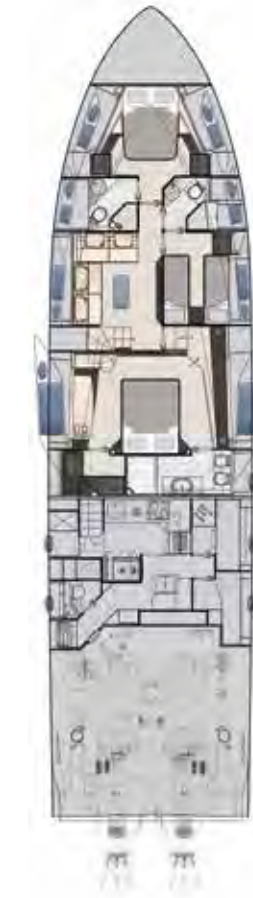
Lower Deck | 3 cabins with lower dinette layout (opt)