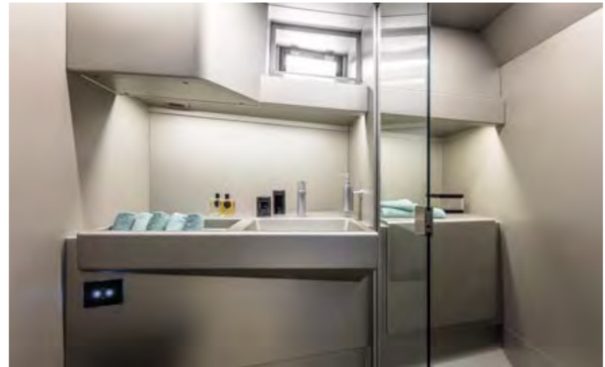
Air-conditioned cabin Generous bathroom with separate shower