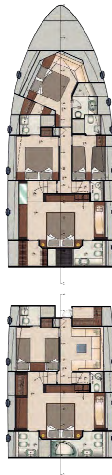
Sub Lower Deck